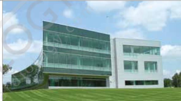
Mindray DS USA, Inc. U.S. headquarters in Mahwah, NJ

Mindray DS USA, Inc. 800 MacArthur Blvd., Mahwah, NJ USA 07430 Tel: 1.800.288.2121 or 201.995.8000 Fax: 1.800.926.4275 www.na.mindray.com