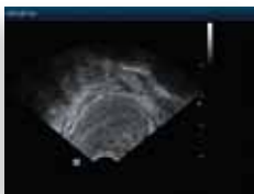
GYN transvaginal imaging

Evaluating patients in today's demanding environment takes innovative technology to speed up diagnosis with greater confidence. Mindray's DP-50 versatility expands your clinical utility while improving patient care.