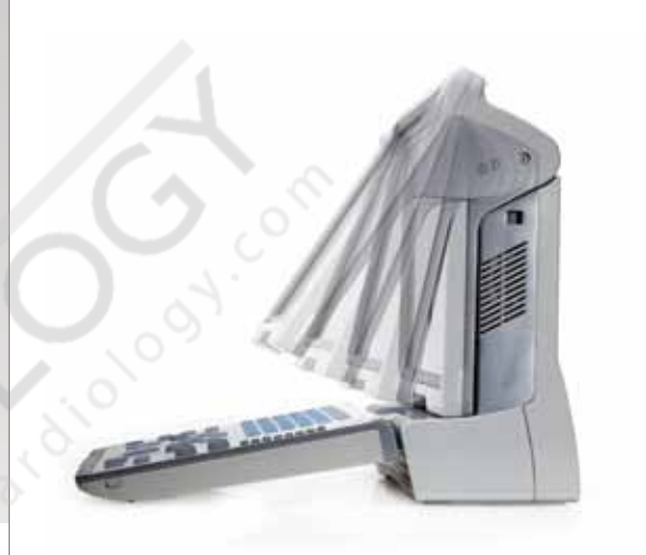
Tilting LCD display allows easy viewing