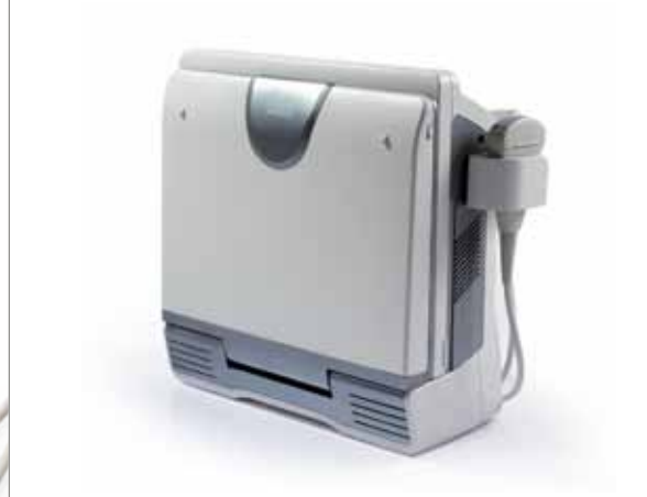
Compact and lightweight for enhanced mobility