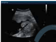
OB imaging – fetal foot

The insightful design reaches a wide range of clinical applications including abdomen, urology, OB/GYN, small parts, emergency, orthopedics, endocavity, and interventional medicine.